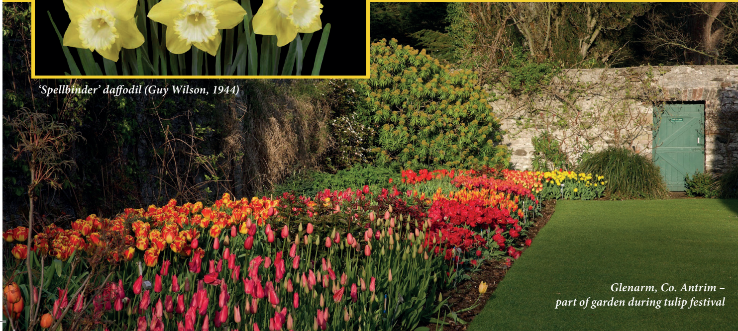
Glenarm, Co. Antrim – part of garden during tulip festival