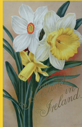
Hogg & Robertson, 1901 & 1907