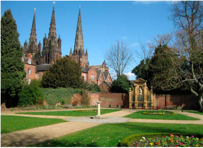
Figure 7 The Garden of Remembrance, Lichfield (Staffordshire), opened in 1920, adjacent to but quite distinct from the adjoining Museum Gardens. It forms part of the Grade II-registered Cathedral Close and Linear Park.