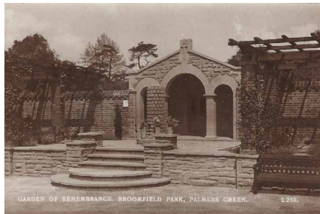
Figure 6 The memorial garden in Broomfield Park (London Borough of Enfield), a design influenced by the pre-war Arts and Crafts movement. Registered Grade II.

After the Second World War, commemoration was again organised by local war memorial committees, and again parks and gardens were often considered the most appropriate form of living memorial. Where public opinion was sought there is evidence of a very strong antipathy towards monumental memorial. While there was some debate after the First World War, it seems that objections to sculptural and architectural memorials had hardened by the 1940s. The