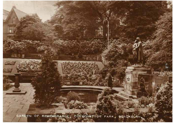
Figure 8 The Garden of Remembrance in Corporation Park, Blackburn, unveiled in 1924. The park, registered at Grade II, was opened in 1857.

‘the laying out and maintenance of the enclosure as a beautiful little garden should be as much a part of the Memorial as the erection of a piece of sculpture. It should be treated worthily and reverently as a little piece of Stoke Newington belonging to the men who went from our Borough to fight for their native land. Here, where they themselves were wont to pass, flowers, through all the changing seasons of the year, would greet their memory.’