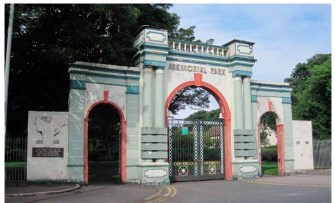
Figures 11 (top), 12 (middle), 13 (bottom)

Top: Dawley Memorial Park (Telford & Wrekin), opened in 1902 to mark the coronation of Edward VII and rededicated as a memorial park after the First World War. A prominent display of the commemorative function is characteristic of memorial park entrances. Middle: View of the Grade II-listed gates at Ashbourne Memorial Park, Derbyshire, which was opened in 1922.