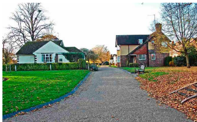
Figure 15 The City of Worcester Homes for Disabled Sailors and Soldiers were incorporated within the design of Gheluvelt Park from the outset.

In some instances, a group of war memorials was enabled by generous fund-raising. In Ilford for example, the £10,000 raised by the memorial appeal after the First World War was used to purchase the site for the War Memorial Gardens, to erect a monument, to build a children's wing to the hospital and to build a memorial hall. The park thus has a group value associated with these other memorials as well as its own specific significance. To modern eyes, some of these juxtapositions can seem incongruous, but recognising the extent and diversity of memorial parks and gardens is essential to understanding the nature of commemoration.