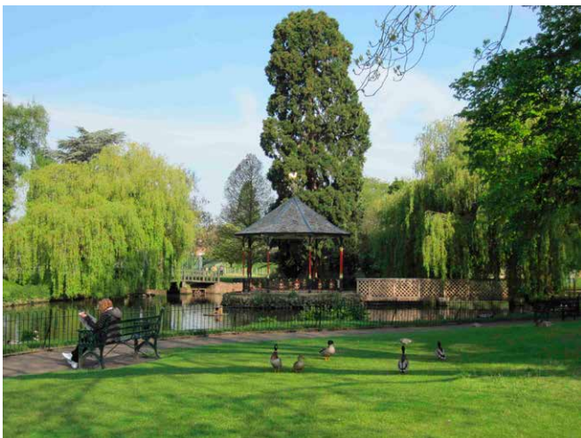
Figure 3 Gheluvelt Park, Worcester (registered Grade II), named after the 1914 battle in which the Worcester Regiment played a distinguished part. Opened in 1922, its character is largely that of a typical late Victorian or Edwardian public park.

War memorial parks and gardens comprise a range of different types of designed landscape, varying widely in size and design. Some are small sites, designed as no more than the settings to a sculptural or architectural memorial; some are gardens in which such a memorial is an important but subsidiary part, often in its own planted setting; some are public parks largely comprising sports pitches; and some are parks with a range of traditional amenities such as bandstands, lakes and ornamental planting alongside the usual provision for sports such as tennis or bowls (Fig 3). The typology should also include memorial avenues and bigger planting schemes such as the Whipsnade Tree Cathedral (Bedfordshire) and the National Arboretum at Alrewas (Staffordshire), where ‘our nation remembers.’