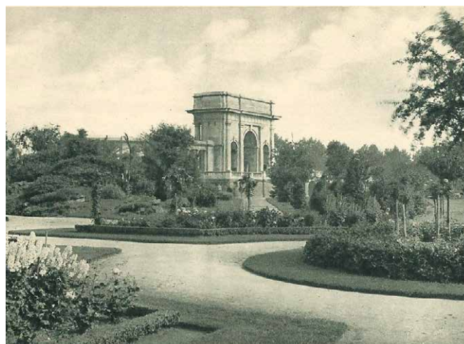
Figure 2 Nottingham Memorial Gardens. The Grade II-registered gardens are only the core of the memorial landscape, most of which comprises playing fields for the neighbouring schools. The Memorial Arch, unveiled in 1927, is Grade II-listed.

While, as will be seen, most war memorial parks and gardens originated after the First World War, a significant number were also created as Second World War memorials. In this advice, the emphasis is on designed landscapes created after the end of the First World War, although it does look ahead to what happened after later conflicts. Brief notice is also given to wider memorial landscapes, although the topic lies beyond the scope of the present document.