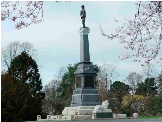
Figure 1 The South African War Memorial at Crewe of 1904 (listed Grade II) within the Grade II*-registered Queen's Park. Prior to the First World War, war memorials were generally erected by regiments or wealthy individuals.

It also demanded a different type of commemoration. While many cities, towns and villages favoured a traditional sculptural or architectural monument, many others (often with ex-servicemen taking the lead) discussed and opted for a memorial which, instead of focussing on the dead, would serve the needs of the living. The arguments often seem to have reflected political divisions, drawing on Lloyd