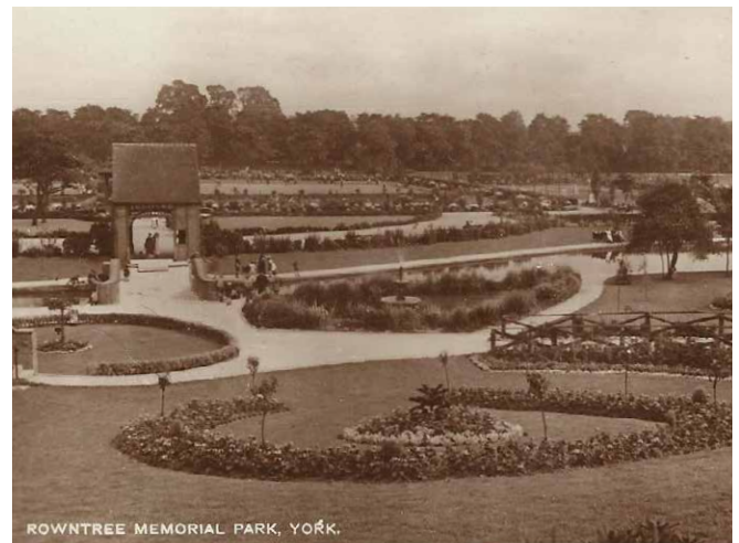
Figure 4 Rowntree Park, York (registered Grade II), an early photograph taken when its name still included the word ‘Memorial’.

Inevitably, given the local nature of their development and subsequent maintenance, the taxonomy of these memorial landscapes is inconsistent. War memorial parks, war memorial playing fields,