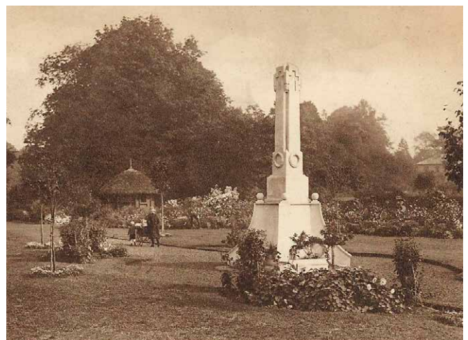
Figure 10 An early view of Romsey Memorial Park (Hampshire), opened in 1920; the Grade II-listed war memorial was unveiled in 1921. As the principal park in the town it contained most of the amenities associated with a typical public park.

A memorial park often grew from a pre-existing aspiration for a public park. In Romsey in Hampshire, a park had been discussed for many years before the First World War, and the end of the War gave the campaign fresh impetus under the banner of commemoration. What was laid out was a traditional public park of some 2ha. complete with bandstand and ornamental planting (Fig10). Negotiations to purchase the estate which became Gheluvelt Park were opened as early as 1912, while the Memorial Park at Herne Bay in Kent was created on a site where a park had first been proposed in 1894. In other cases, as at Kirkham, a pre-existing park was adopted as a memorial. At Chingford in Essex, the Memorial Park was laid out in 1930 around the pre-existing war memorial garden. The site was extended to some 3.8ha. and became the Urban District Council's first municipal park, with a range of amenities including a bandstand and ornamental pond as well as sports pitches and a bowling green.