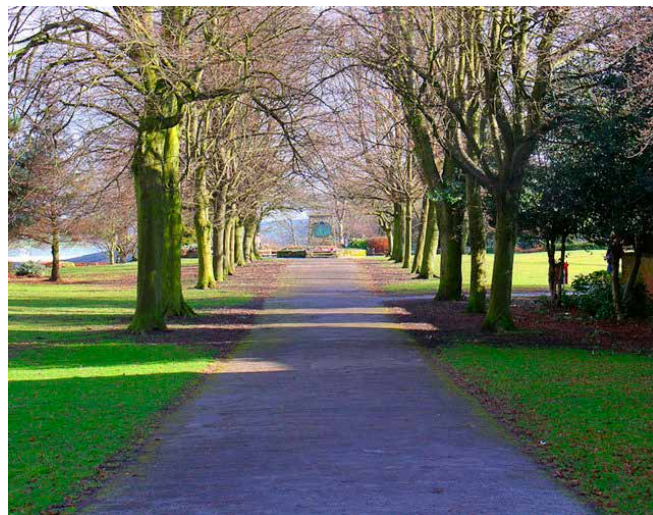
Figure 14 The avenue at Heanor Memorial Park, Derbyshire, opened in 1951. Conceived in 1945, the park included a new war memorial but was primarily so 'all people, young and old, could enjoy the beauties of nature in lovely surroundings'. Facilities included tennis courts and a children's playground.

Memorial trees were also planted singly or in informal groups in a number of parks. At Coventry some 249 trees were planted individually along the paths as memorials to the dead of the First World War, but the tradition has continued and there are now approximately 800 memorial